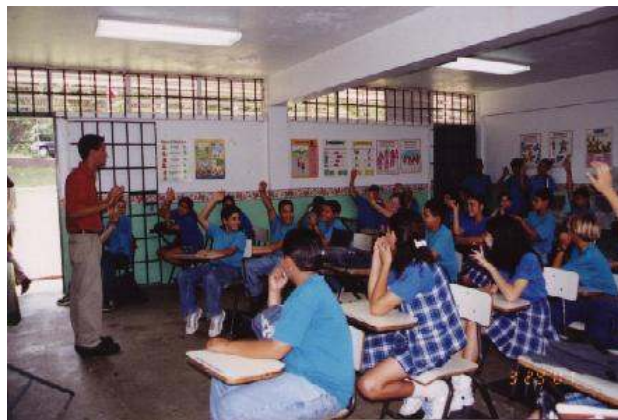
FIGURE 5 ETTAP INTERN GIVING A TRANSPORTATION-RELATED SEMINAR TO MIDDLE-SCHOOL STUDENTS.

ETTAP provided training and development to students in K-12 levels in transportation-related fields through the use of internships and fostered interdisciplinary opportunities for students in the field of transportation. Figure 5 presents one of the interns giving a transportation-related seminar to middle-school students. The ETTAP program agreement increased the skills and understanding of technical issues and research skills of students, including students with disabilities, promote and encourage the participation of students with disabilities in transportation-related contracts and fostered interdisciplinary opportunities for college students in the field of transportation.