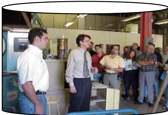
FIGURE 2 TECHNICAL SEMINAR OFFERED TO LOCAL TRANSPORTATION OFFICIALS.

The seminar program includes technical seminars and supporting tool-related seminars. Technical seminars correspond to topics of technical nature related to transportation, such as pavement design methodologies and construction procedures, pavement evaluation and maintenance techniques, management of transportation projects, material testing and selection procedures, safety evaluation and analysis of highway facilities, traffic engineering, and development of geographic information systems. Figure 2 presents one of our seminars offered to local transportation officials in the Laboratory of Structural Engineering in the Civil Engineering Department at the UPRM.