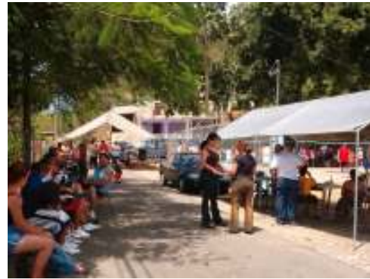
FIGURE 6 EPICS COMMUNITY SERVICE ACTIVITY.

The PR-T 2 Center director and the UPRM Department of Civil Engineering and Surveying, in collaboration with Purdue University, participated in the EPICS Program [1]. EPICS is an innovative program that creates partnerships between teams of undergraduate students and non-for-profit local community organizations to solve engineering-based problems in the community. During the years 2002 and 2003, engineering students worked in collaboration with students from the Department of Social Sciences, Humanities and other disciplines from the UPR Mayagüez and Aguadilla Campuses, and with the University Institute for the Development of the Communities, in community service projects in over 35 communities of the western region of Puerto Rico. Figure 6 presents one of the EPICS activities in one of the communities selected for the service projects.