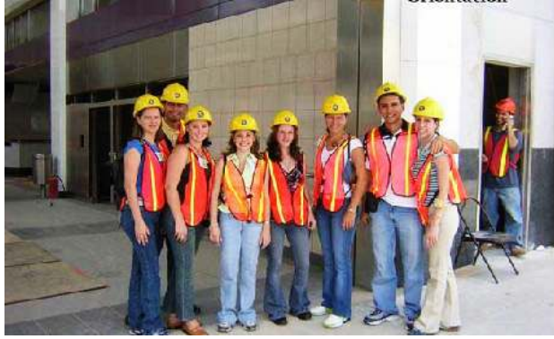
FIGURE 3 UPR / MIT / TU GROUP 10 STUDENTS VISITING A TREN URBANO STATION CONSTRUCTION SITE.

Over 300 research projects were developed in this successful initiative in partnership with MIT and other supporting universities. Many students that participated in this program have been employed by Alternate Concepts Inc. (the firm operating the TU), “Alternativa de Transporte Integrado (ATI)” Office (the government office in charge of supervising the TU operation and its integration to other transportation modes), local government transportation offices, and private consultant firms.