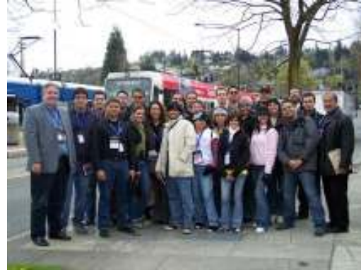
FIGURE 4 UPR / PUPR / ATI GROUP 3 EXPLORING THE PORTLAND TRI-MET TRANSIT SYSTEM.

During the first two years of the program, undergraduate and graduate students, with faculty mentorship from the three campuses, learned about the interaction among professionals and focused on the integrated operation of the TU. This program is similar to the earlier UPR / MIT / TU Program with a new emphasis on analyzing the effectiveness of the SJMA public transportation system since the TU started operations, and the many impacts the TU is having on the SJMA and on its integration to other public transportation modes. Figure 4 presents one of the program elements with a group of our students visiting the Portland TRI-MET system to learn about its history and operation to transfer those experiences to the ATI and TU in Puerto Rico. Over 30 research projects have been completed as result of this initiative.